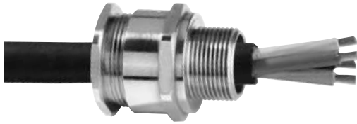
Dimensions in Millimeters (Inches)

CEC: Rated for Non - Hazardous Locations Type 4x