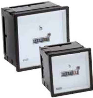
Elapsed Time/Hours Run Meters AC