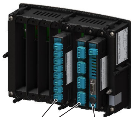
Up to 7 plug-in input and output interface modules Plug-in CPU module

Documentation and support are extensive including instruction manuals for the display, CODESYS software and each of the plug-in modules, plus videos and application guides. CODESYS runtime is a well known industry standard software package. Demonstration systems can be viewed at the BEKA sales office and at some BEKA agents. Loan systems are available for evaluation and programme development.